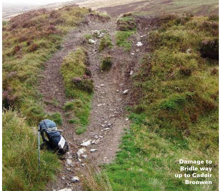
Damage to Bridle way up to Cadair Bronwen